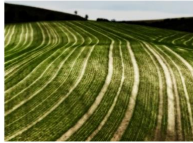
Allan Grainger, A View of Bullock Hill , 2020 Hahnemühle Print ©The Artist