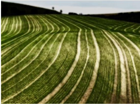
Allan Grainger, A View of Bullock Hill, 2020 Hahnemühle Print. ©The Artist

The South Downs are a range of chalk hills spanning the counties of Hampshire, West Sussex, and East Sussex. Renowned for its rolling landscapes, chalk cliffs and diverse wildlife, this area is characterised by a mix of farmland, ancient woodlands, heathland and grassland, as well as historic towns and villages. The region is also well-known for its archaeological sites, including ancient hill forts and remnants of Roman and medieval settlements.