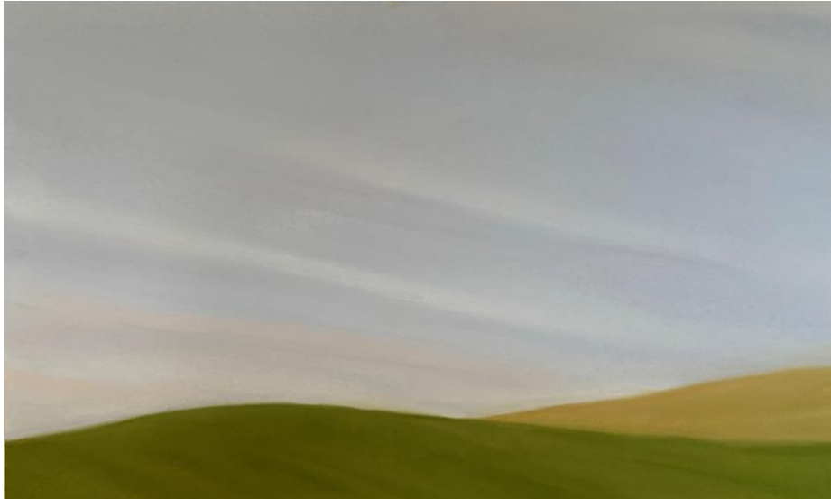
Sara Lee, Nurture , 2024, Pastel on paper. ©The Artist

Exhibiting nearly 150 works by over 120 artists, Petersfield Museum and Art Gallery's South Downs Open (22 October 2024-1 February 2025) is a spectacular way to celebrate the beauty of the South Downs. Visitors will be able to enjoy paintings, drawings, prints, photography, sculpture, textiles and ceramics that draw inspiration from across the South Downs region, from Old Winchester Hill in Hampshire to Beachy Head, in East Sussex.