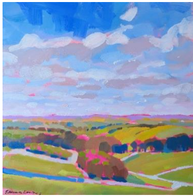
Emma Lowres, Cheesefoot Head , 2024 Oil on board ©The Artist