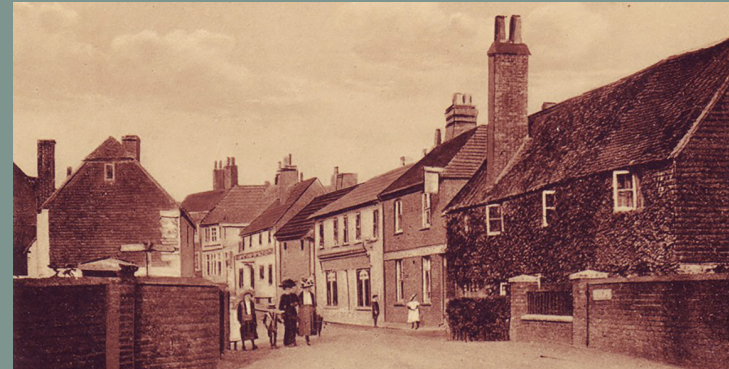
3 The Forebridge around 1910