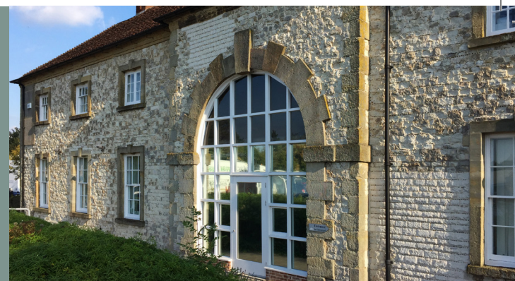
2 The Grange

12 During World War Two, Steep House was used as a rest home for sailors from the Free French Navy. It is thought that General de Gaulle visited while inspecting French establishments in Portsmouth.