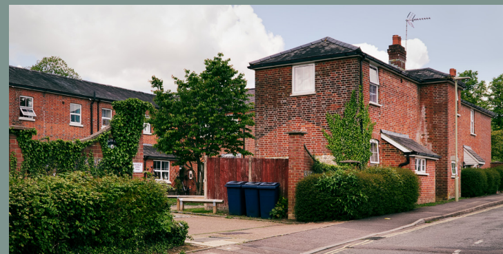
8 The former Petersfield Union Workhouse