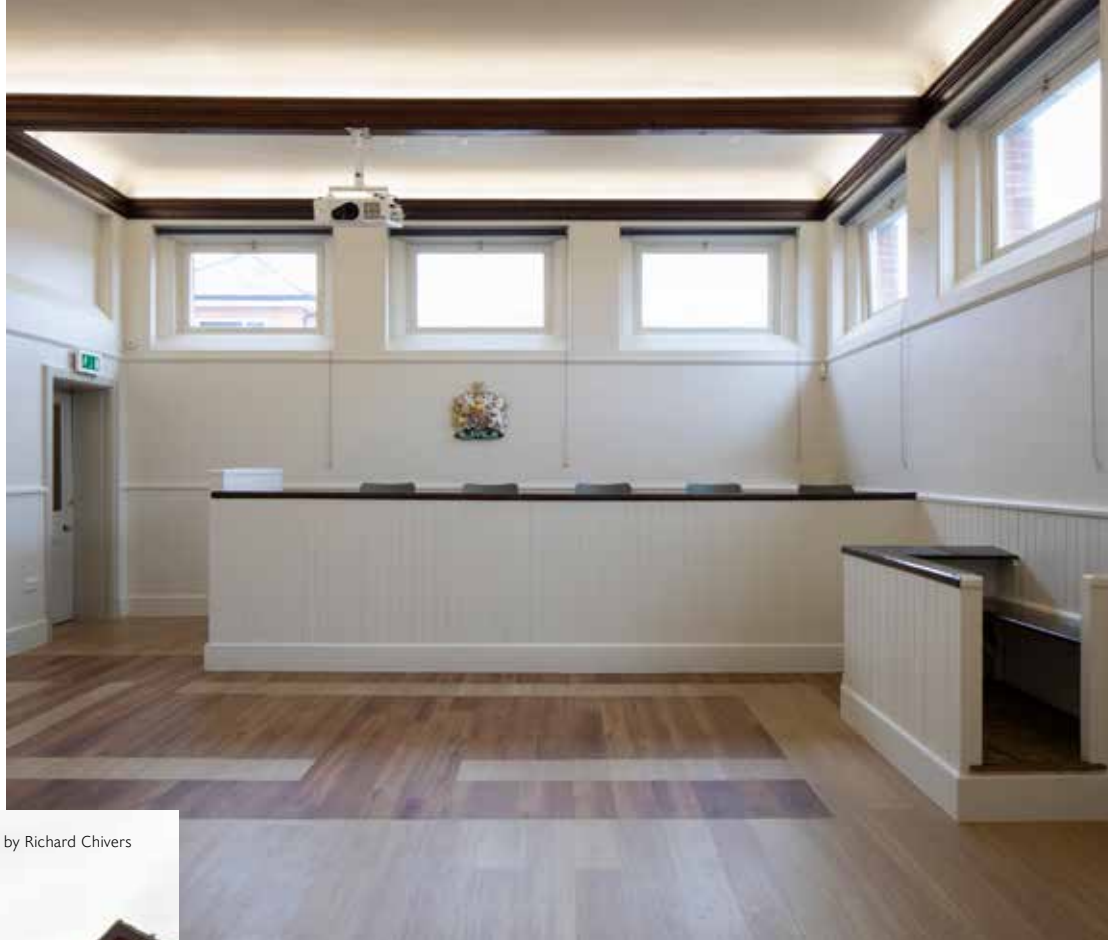
The Courtyard.

For further information, please contact hospitality@petersfieldmuseum.co.uk or call 01730 262601